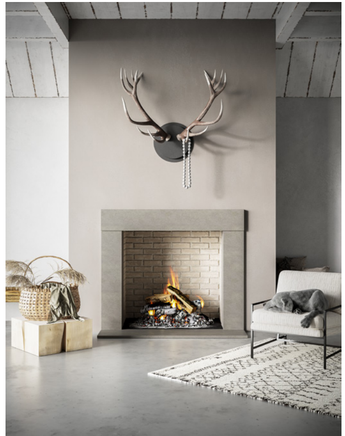
Shown in "Concrete" color. Hearth and trim kit sold separately.